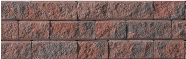
BURNT RED BLEND