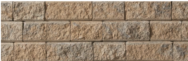
DESERT GREY BLEND