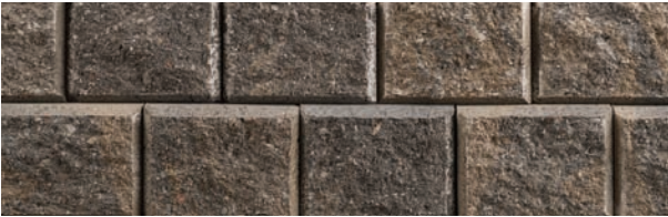
DESERT GREY BLEND