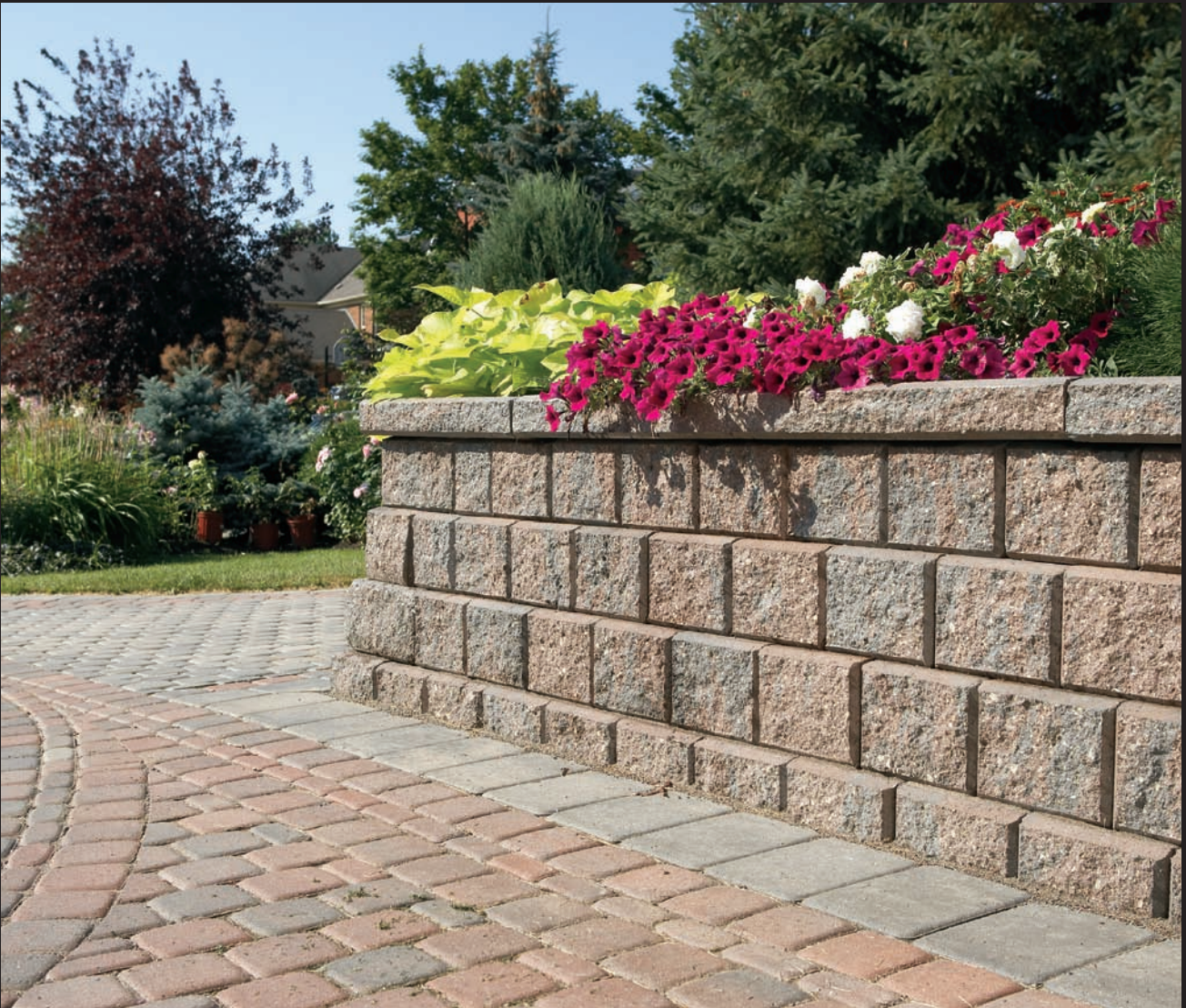
RB WALL - WALNUT BLEND