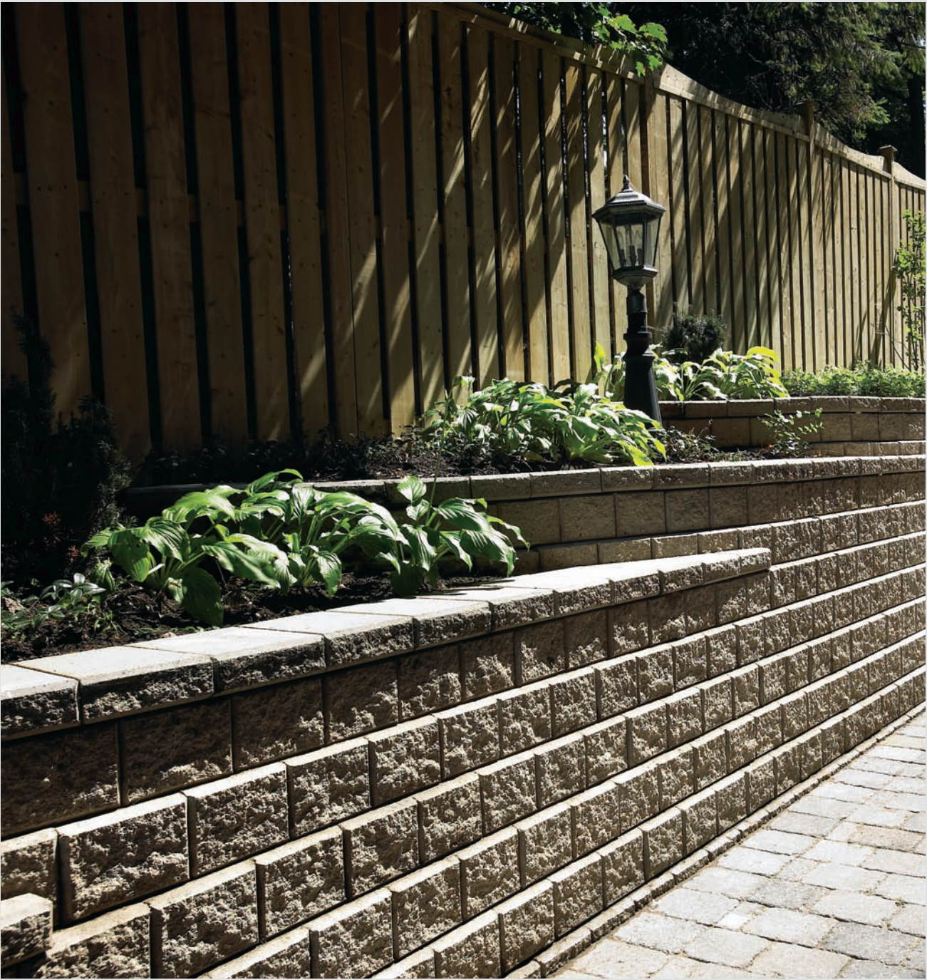
RB WALL - NATURAL