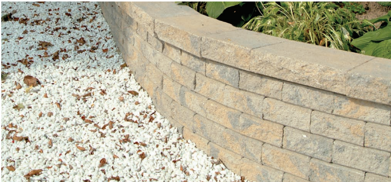
DESERT GREY BLEND